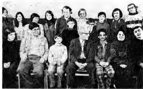
26. Botvinnik's chess school